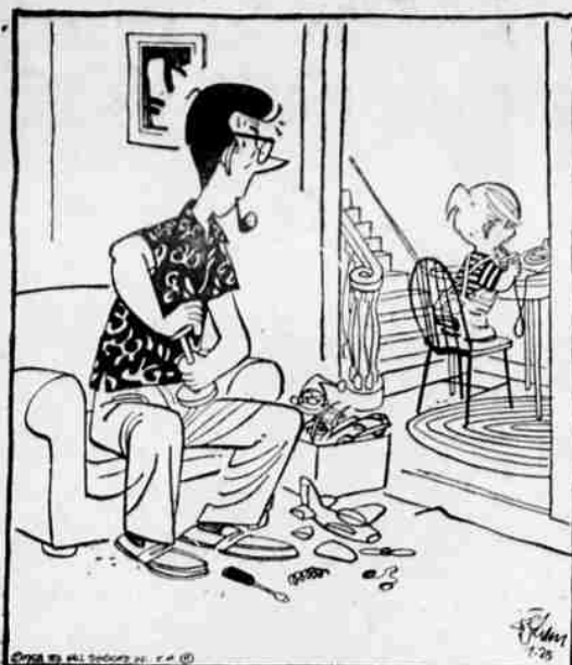
*C'MON OVER, TOMMY, AN BRING ALL YOUR BUSTED TOYS! IT'S MY DAD'S DAY OFF!*