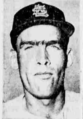
WALLY MOON ... helps Cards Win

By THE ASSOCIATED PRESS What makes that National League race so tough? A playing pattern that gives you a three-game sweep from a club one week then hands you a loss to the same bunch a week later. Ask the Milwaukee Braves and the Chicago Cubs. The Braves, with a chance to regain first place from idle San Francisco, blew 3-0 and 4-3 leads last night and were beaten 5-4 in 14 innings by the St. Louis Cardinals. Curt Flood's sixth homer gave it to the Cards, who lost