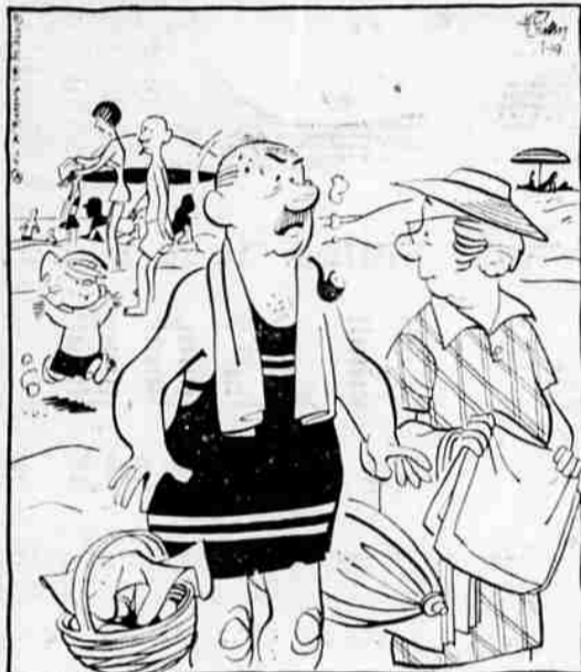
"MR. WILSON! MRS. WILSON! BOY, IS THIS EVER A KEEN SURPRISE!"