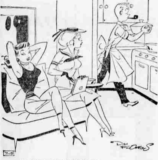
"Oh, yes—I've been on the five-day week for some time."