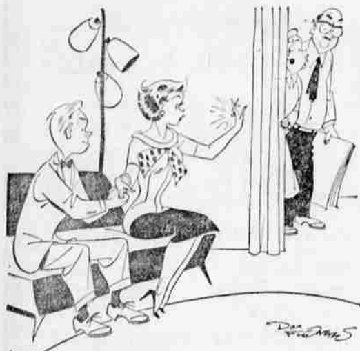
"It's about time. She caught nine bride's bouquets last month!"