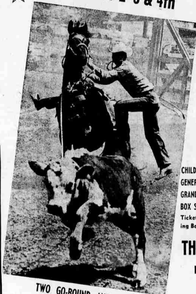
TWO GO-ROUND AVERAGE RAIN OR SHINE