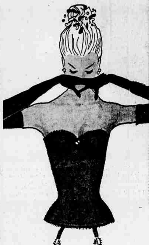
13-17 Wisp of sheer nylon and light elastic curving upward from your hips to form a most romantic figure. Sizes: Colors: $15.00