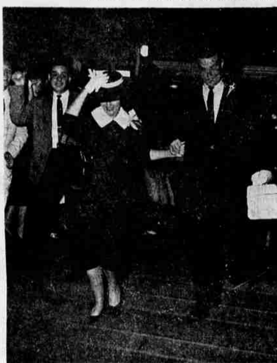
THE BRIDEGROOM is almost hidden in a shower of rice as he and his bride leave the reception at All Saints' Episcopal Church.