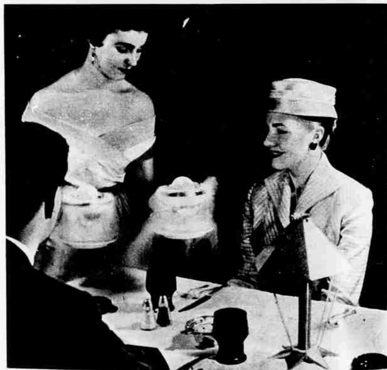
SMOKED SUNDAY: The cold, smoky block of dry ice gives a special aura to the food

Entrance to the restaurant is a small museum depicting the history of bull fighting. Wall posters advertise the fights of years past. A banderillero's cape, a matador's hat is wall panel decoration. Everything here was purchased from Bosaclás Cuevas, Madrid matador.