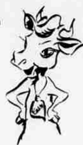
Bessy, the Basin Bossy