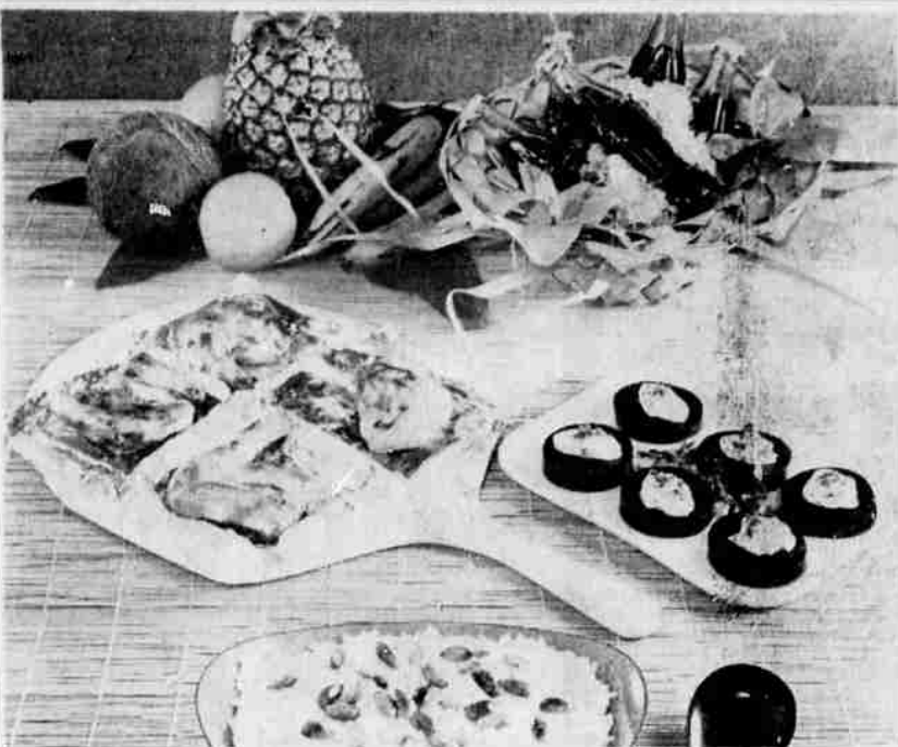
CHICK-N-QUE IN FANCY DRESS is shown in this picture of an informal Hawaiian patio party with Chicken in Herb Butter, Almond Rice, Frosted Cranberry Sauce and cold Coca-Cola.

Blend a quarter cup of butter and 1/2 teaspoon curry powder and spread on eight slices of French bread. Place in a hot oven until crispy. Serve with creamed chicken or with soup.