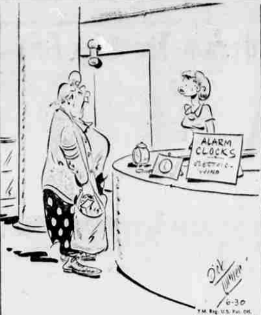
"My husband is very hard to get going! Do you have one that sounds like a burglar alarm?"

The fund campaign will be held in September. No goal has yet been announced.