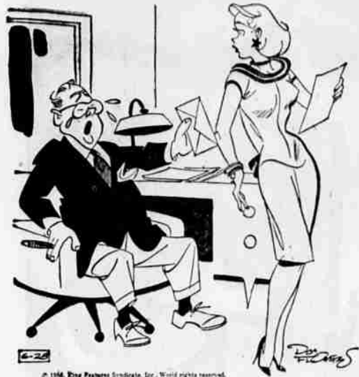
"My wife has given me a day's notice to give you two weeks' notice."