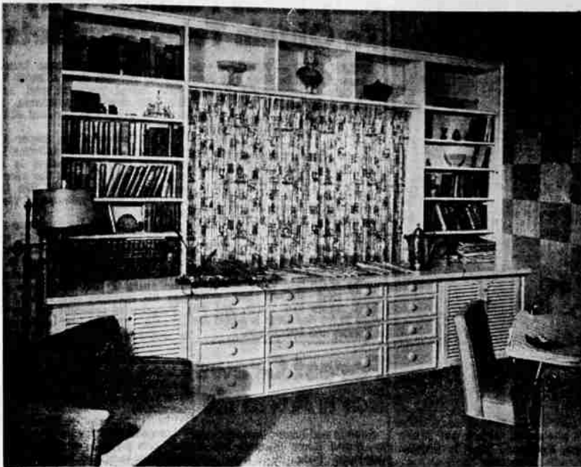
A BUILT-IN of western pine lumber may be designed to convert space that normally would be unused into storage where it is needed. This attractive unit built around a window is utilitarian and decorative in its living room setting. A unit may make use of ready-made cabinets, chests, and bookcases of ponderosa pine or any of the other western pine species and louvered doors, usually of sugar pine. Many lumber yards carry ready-made pieces.