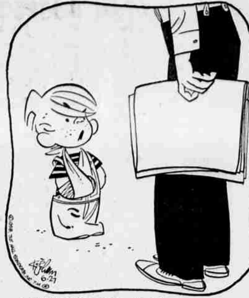
"MAYBE THE DOCTOR SAYS IT'S JUST A SPRAIN, BUT I SAY IT'S BROKE!"