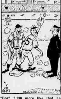
"Boy! 2,990 more like that and I'll join Musial in the 3,000-hit class!"