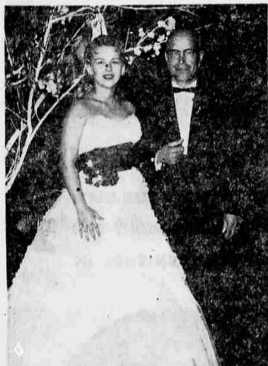
FATHERS ARE TRADITIONAL ESCORTS for graduating seniors at the Stephens College Commencement Ball, which is one of the outstanding annual social events on the Columbia, Missouri campus.