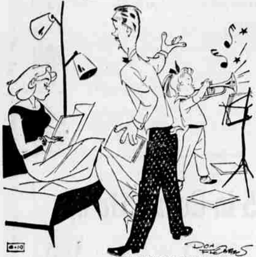
"How long before 'practice makes perfect'?"