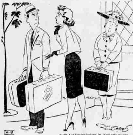
"But, darling, Mother's never been on a honeymoon."