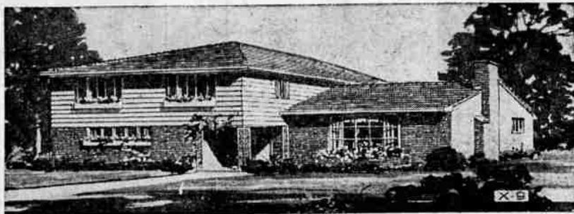
WROUGHT IRON TRELLIS COLUMNS and wood and stone flower boxes greet the visitor to this multi-level "green thumb" house. The arrangement of its levels is based on a technique used by Oriental experts in planning terraced gardens.