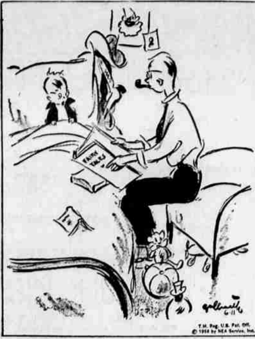
"Never mind about Freddie the Fearless Frog, Daddy—read Elmer Egghead Among the Isotopes!"