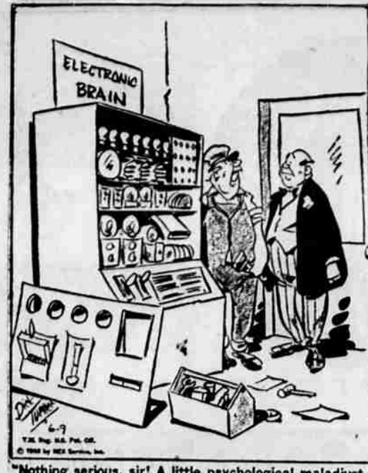
"Nothing serious, sir! A little psychological maladjustment caused by the tempo of modern living!"