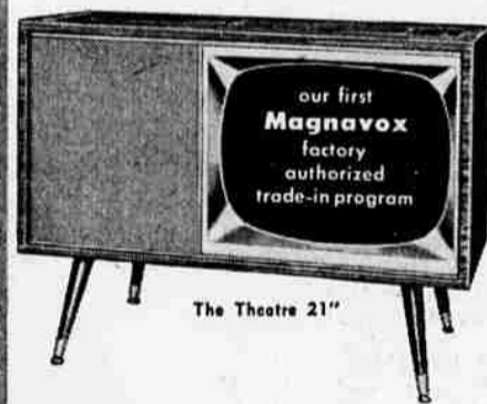
The Theatre 21"

Enjoy this 21" TV with Hi-Fi Phonograph Combination