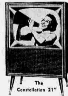
The Constellation 21"

Magnavox full consoles from only $199 90