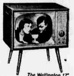
The Wellington 17"

. . . Full Console 21" Television . . . an example of unequalled Magnavox value. Full-transformer chassis, optical filter, reflection barrier, 8" Magnavox speaker and convenient top controls. Choose from several finishes.