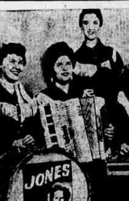
In Person, Tomorrow Night

FOR SALE—Aster Plants 3 Doz. $1 Peonies and other plants 207 E. Main