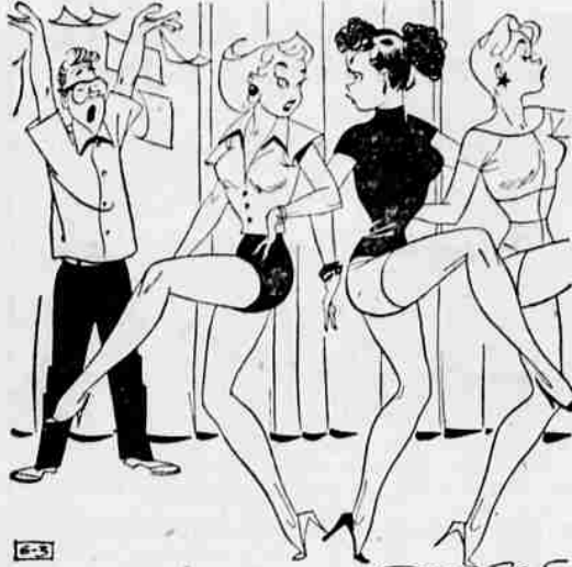
© 1958 King Features Syndicate, Inc. World rights reserved. "What does he mean, 'Integrate with the group'?"