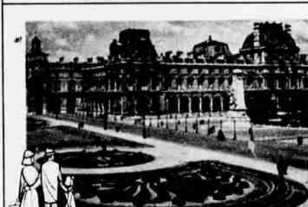
YOU visit the Louvre. Now a world-famous art museum, it was originally a fortress, and later served as a palace of kings.