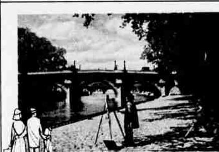
YOU view Pont Neuf, most famous bridge of Paris. Completed in 1606, it had the only sidewalks in the city.