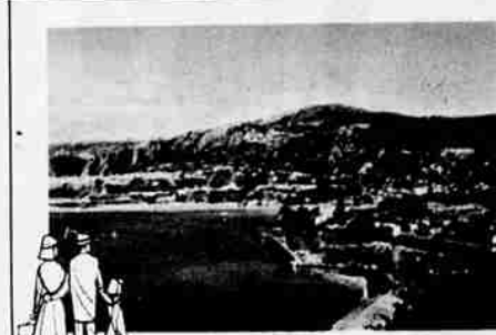
YOU bask in the sun of the French Riviera, fabulous playground of glittering celebrities, royalty, and fun-loving millionaires.