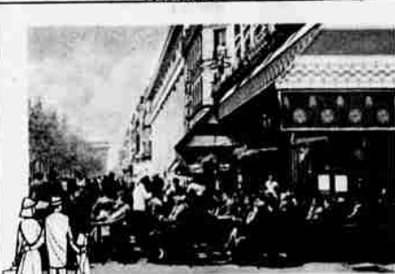
YOU stroll along the magnificent tree-lined Champs Elysées, and visit favorite haunts like this charming sidewalk cafe.