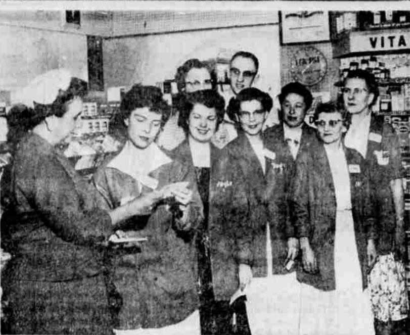
PAYLESS DRUG STORE employes signed pledge cards to donate pints of blood during the coming visit of the Red Cross Bloodmobile to Klamath County, June 4-5.

Police this morning said they plan to question the youths further. The teen-agers told officers they had committed so many thefts, it was impossible for them to remember them all.