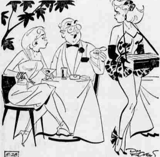
"There's no fool like an old fool, but don't ever try to fool THIS old fool."