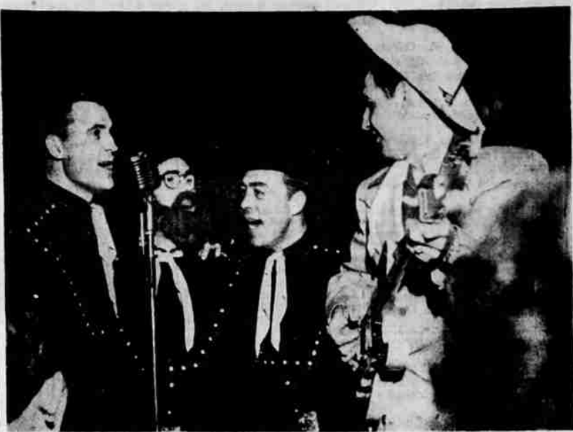
HANK THOMPSON, right, accompanies three of his Brazos Valley Boys in a specialty number. Hank and his band will be at the Old Armory on Saturday night.

CATHOLIC STATISTICS NEW YORK (UP) — The Catholic Church in the United States, Alaska and the Hawaiian Islands has grown from 26,075,697 members 10 years ago to 36,023,977, the Catholic directory of 1953 showed yesterday. The largest archdioceses in the country are Chicago, Boston, New York and Philadelphia.