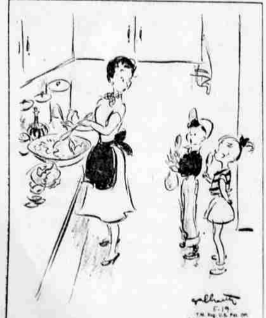
"The store was out of diet bread, Mom, so I did the next best thing—I just bought lollipops!"