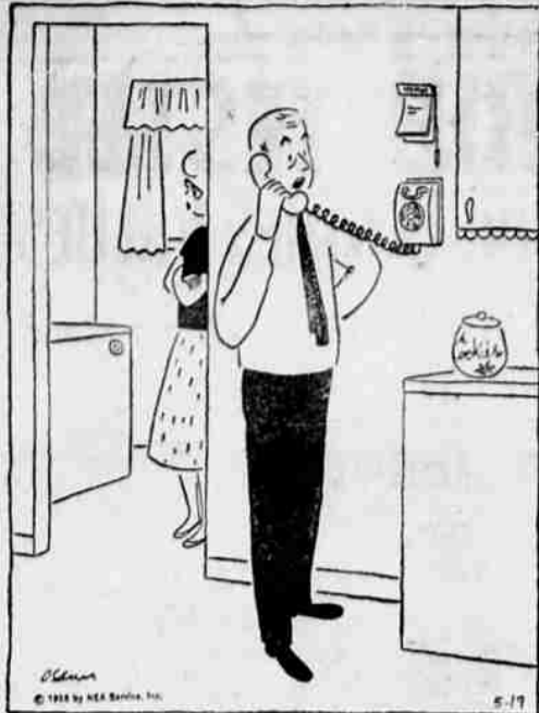
"Sorry, man, but this isn't Dreamboat! This is the skipper, and Dreamboat's in dry dock for tonight!"