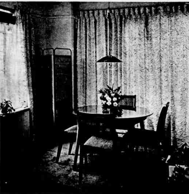
A large window area? Use delicately printed sheer for sense of spaciousness.

(If you would like a free booklet of useful tips on making draperies, write: Draperies, Family Weekly, P. O. Box Z, Chicago 90, Ill.)