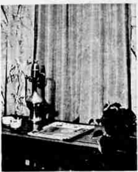
Print, solid sheers combine well.