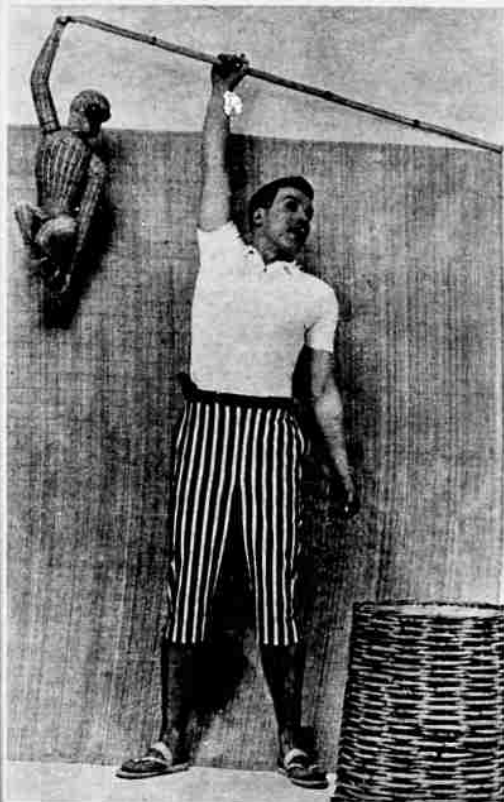
The monkeyshines of a well-dressed beachcomber are provided by Manhattan with their cotton Calypso pants in a bold blazer stripe and drift-rope belt ($6.95), and their classically styled Banlon knit sweater-shirt ($10.95).