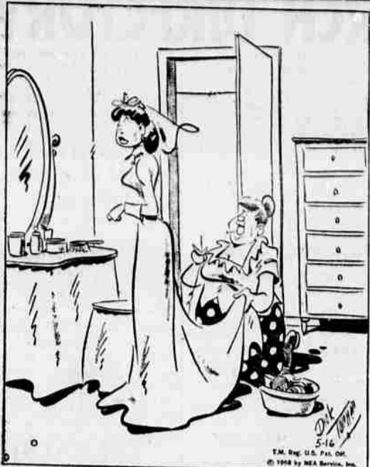
"Remember! Charge everything! Stores can get more money out of husbands than wives can!"