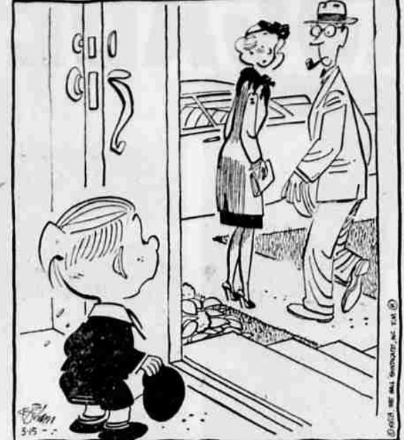
IS THE COAST CLEAR, DAD? I DON'T WANT ANY OF MY FRIENDS TO SEE ME LOOKIN' LIKE THIS!