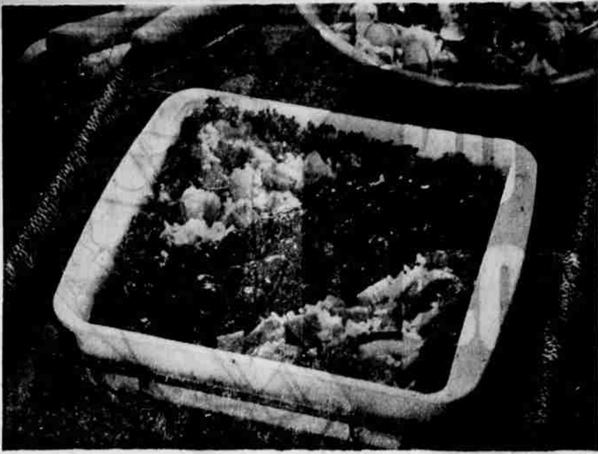
CHERRY-RICE CASSEROLE is suggested by Pacific Kitchen where the recipe was developed by the Cherry Growers and Industries Foundation. The casserole combines a spicy canned cherry sauce with ham and rice and is intended to be served as a main dish.