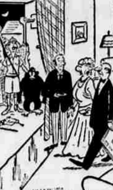
"Don't tell me he's been on another fishing trip! Everytime he returns from on, he insists on giving us fish!"