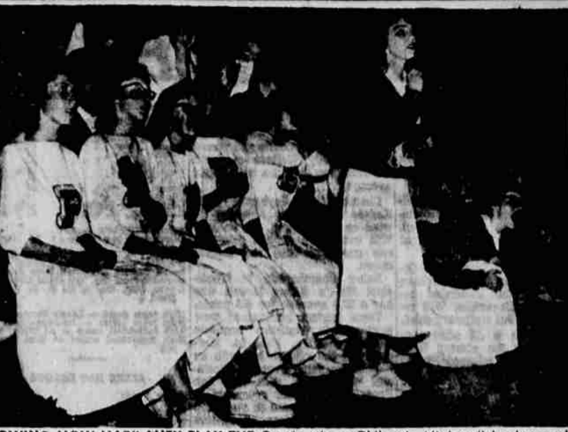
SHOWING HOW HARD THEY PLAY THE GAME, these Chiloquin High yell leaders and rooters are straining every minute as they encourage the Panthers during the county tournament action. Picture above was taken during Friday night's semi-final game against Bonanza, and the Panthers, with this help, won 61-56. The unidentified yell leader in the center, seems to be praying for the Panthers to score again.