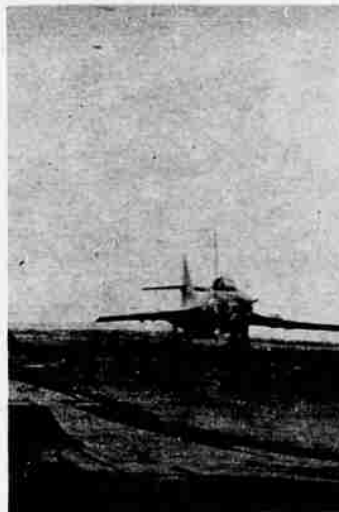
Navy jets use mirrors now to set down on home deck.

MODERN AIRCRAFT CARRIERS are immense only to the landlubber. To jet pilots who must approach them at well over a hundred miles an hour, they sometimes appear little bigger than a raft in a pitching sea. The U. S. Navy, however, has come up with a device to make pinpoint landings almost a sure thing. Technicians have set up a battery of amber lamps behind a specially designed concave mirror which reflects the light upward in a perfect approach pattern. As long as the flyer can see the reflection, he knows he's "on the beam."