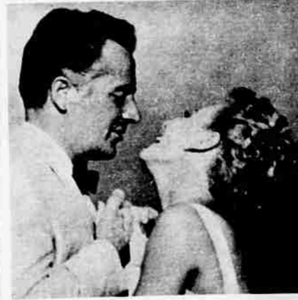
In movie, Miss Gaynor makes love and sings duets with Italian heart-throb, Rossano Brazzi.