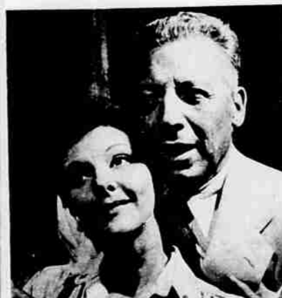
Romantic leads were created on stage by Mary Martin and the late Ezio Pinza.

The biggest problem was beautiful, lush Kauai itself. Logan discovered too late that it got that way from the 700 inches of rain that fall each year. "South Pacific" fans will appreciate Logan's solution to this dilemma—he just waited for sunshine.