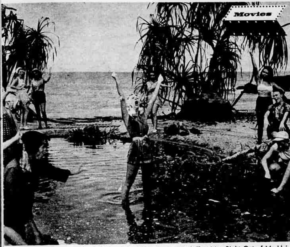
Mitzi Gaynor plays Nellie Forbush, who's still trying to "Wash That Man Right Out of My Hair."

Rossano Brazzi plays Emile deBecque, the role made famous by the late Ezio Pinza, and Mitzi Gaynor is nurse Nellie Forbush, whom Mary Martin portrayed on Broadway. John Kerr is Lt. Joseph Cable, and Juanita Hall, the only member of the original cast, is Bloody Mary.