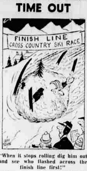
"When it stops rolling dig him out and see who flashed across the finish line first!"