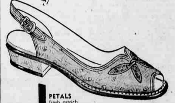
PETALS fresh ostrich trimmed in black 12.95

These new Spring Heydays are a fashion duet of exciting new styles and wonderful wardrobe colors! They're young shoes that perform with the greatest of ease because they're constructed with springy arch that gives flexible support to every step! See them soon!