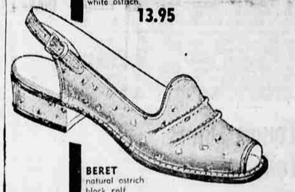
BERET natural ostrich black calf 12.95