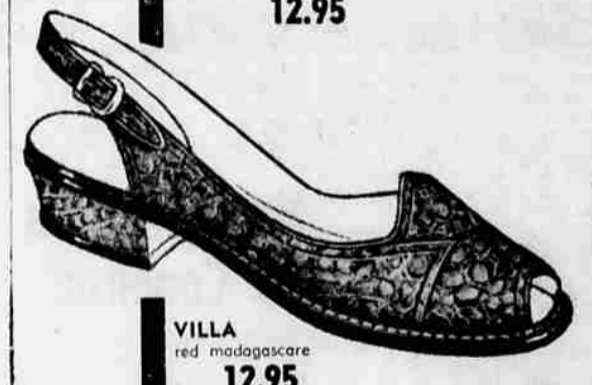
VILLA red madagascar 12.95