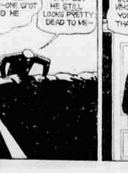
Little Orphan Annie