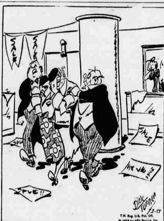
"What do you mean the sale is over? I haven't yet begun to fight!"