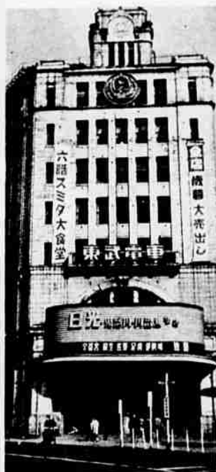
Pedestrian's-eye view of store.