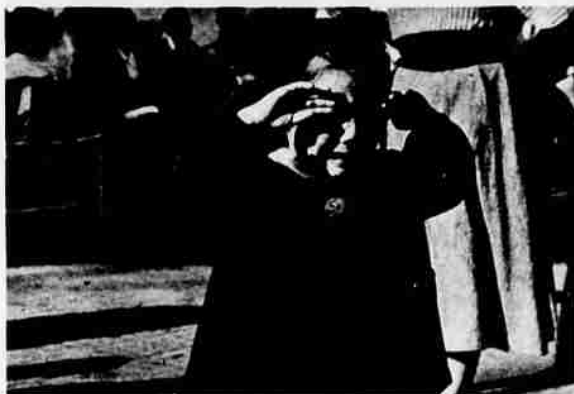
Ah, so! It was ever thus, even in land of rising sun! Amidst laughter, there's always tears of one who lost her mama-san!