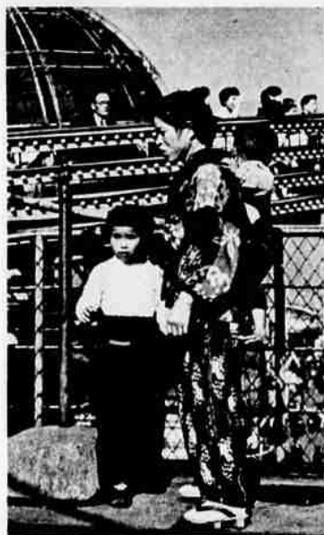
Girl, "piggy-back" boy await turns.