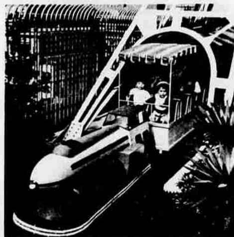
Streamlined choo-choo train fascinates youngsters; diesel-powered model chugs around edge of roof.