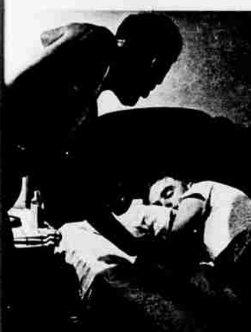
One of the routine night duties is calling the next four-hour watch.