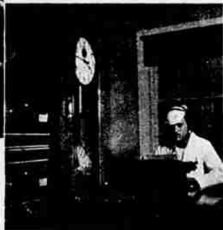
The two-way radio sends bearings 24 hours a day.