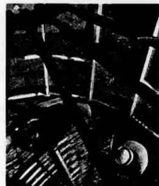
Guardman winds windless that makes light revolve.

LOVELY AS A LIGHTHOUSE KEEPER. That's a phrase we can discard as obsolete. Lighthouse keeping has become an involved technical job that requires the services of many experts. Some even bring along their families on their long vigils. Shown here, for example, is Montauk Point Lighthouse on the easternmost tip of Long Island where nearly a dozen technicians—including two with families—find their vital work lightened by friendship and neighborliness.