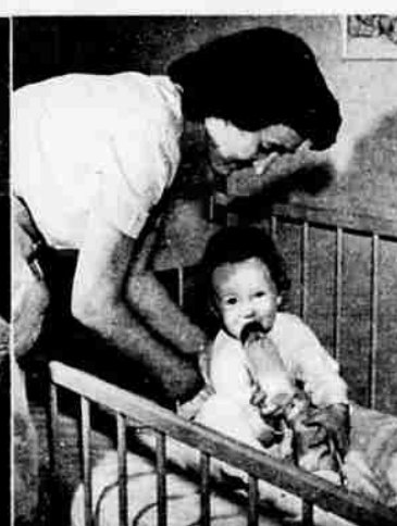
The chief's daughter is secured for the night when the beacon goes on.