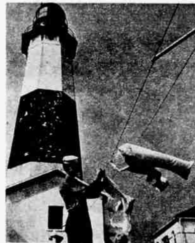
Out here a sailor does his own laundry, just as he would if he were aboard ship.