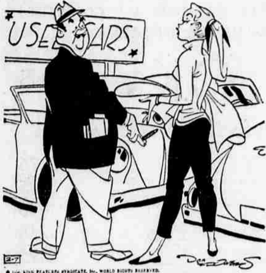
"Which one has the most gas in it?"