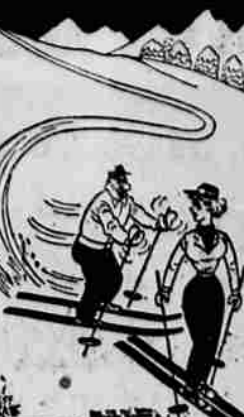
"I've become snow blind, whoever you are. Would you lead me back to the lodge and let me buy drinks for your trouble?"