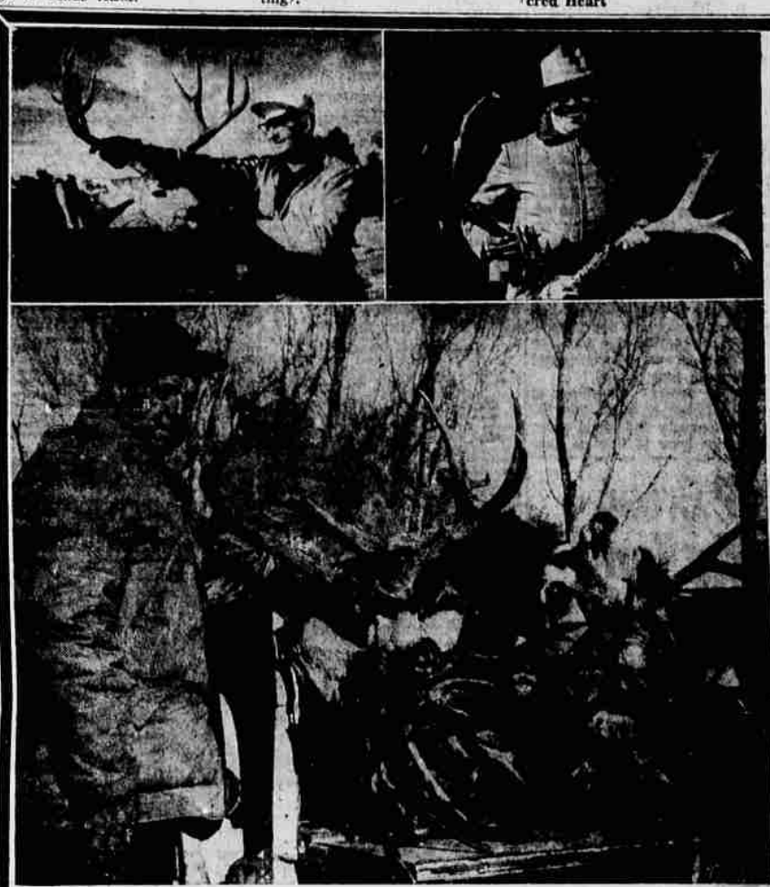
Jim Bond's documentary colored motion picture, "THE MULE DEER" is a fascinating production you will long remember. DOES IT include hunting? You bet it does, and a lot more too. It borders on the spectacular, yet it is true life. Hunters say, "Impossible"; wildlife experts say, "Amazing."