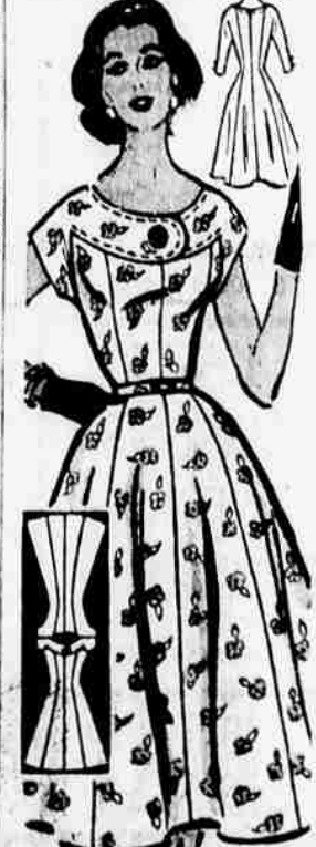
9115 SIZES 10-20 by Marian Martin

EASY-SEE DIAGRAM There's a feeling of Spring in the air when you arrive in this pretty princess with fitted-and-flaring lines. A dream to wear in one of the lively, new silk prints, solid cottons. Sew-easy with our Printed Pattern.