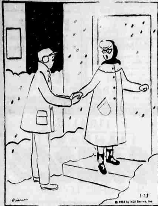
"It was an unforgettable date, Harold, so let's not repeat it!"