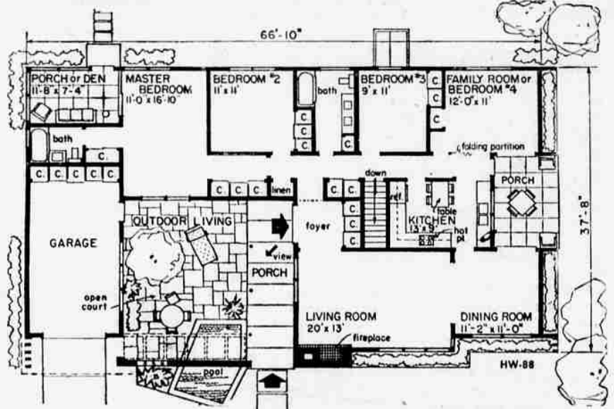
ALL ON ONE LEVEL, this one-story house is in a U-shaped pattern around the court. There are four bedrooms and two baths.