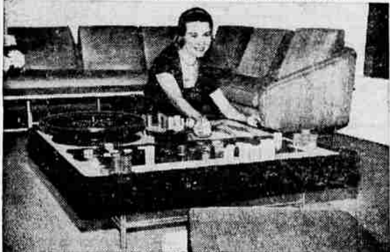
GAME TABLE. When covered with cushions this piece serves as an oversize ottoman. The games are stored underneath.