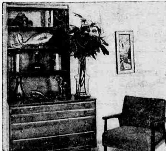
FOCAL POINT. This modern chest and bookcase, shown at the current Chicago home furnishings show is highlighted by American blown glass in a variety of shapes.